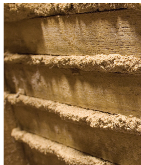
Nibs forming at the back of the laths give a 'finger hold'