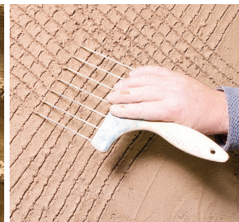
Scratch coat being scratched with a wire comb/lath scratcher!